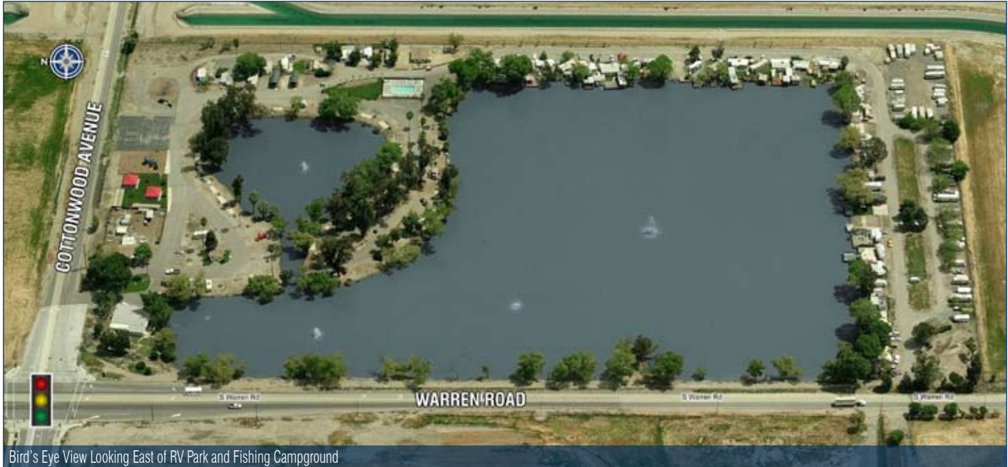
Bird's Eye View Looking East of RV Park and Fishing Campground