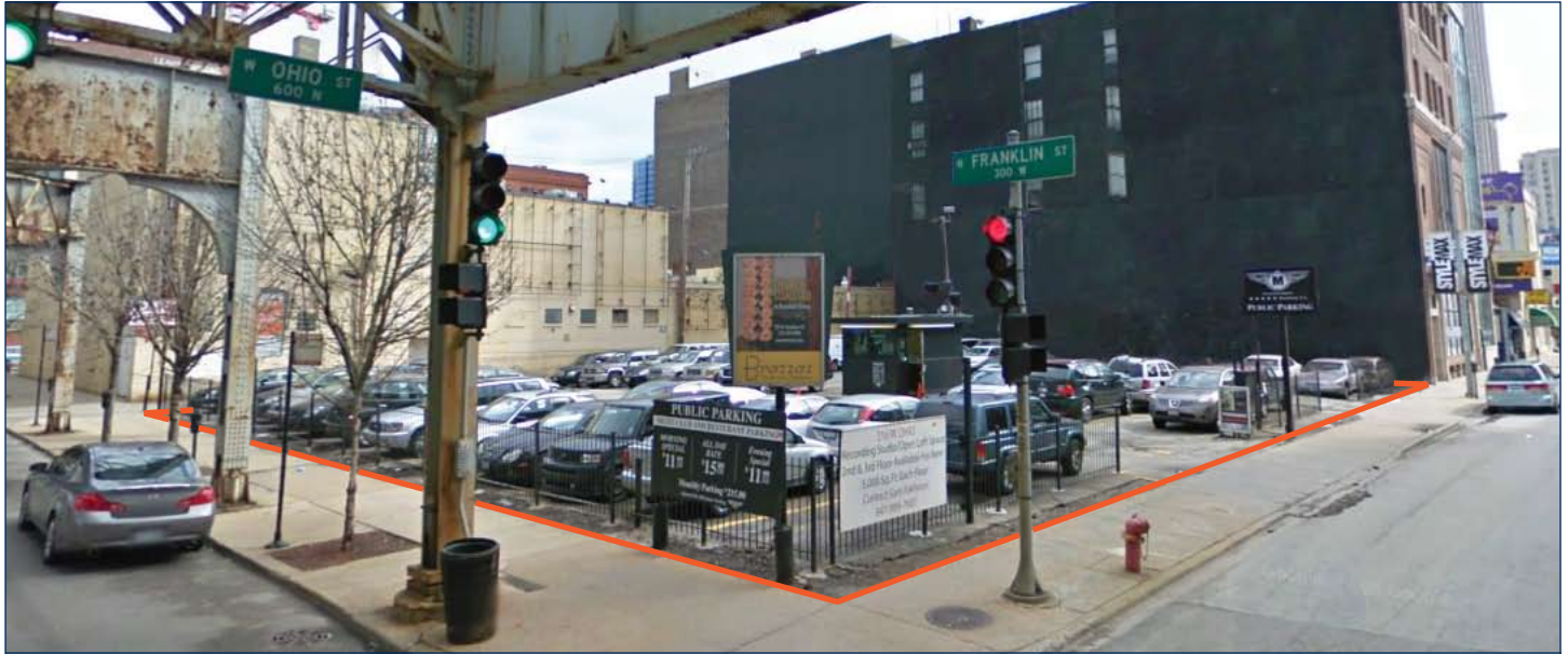
Street View of the Northeast Corner of Ohio Street & Franklin Street