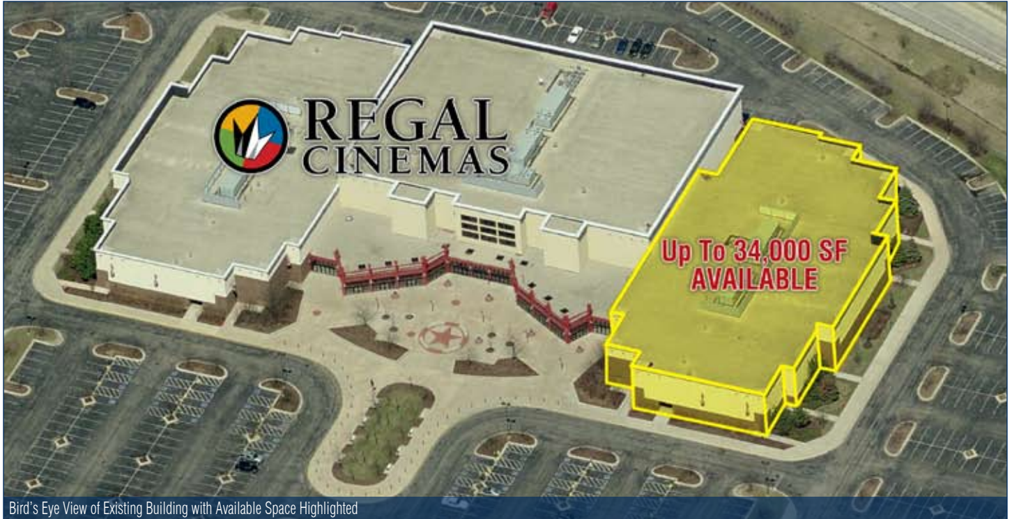
Bird's Eye View of Existing Building with Available Space Highlighted