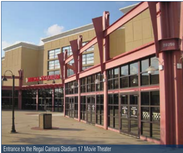
Entrance to the Regal Cantera Stadium 17 Movie Theater