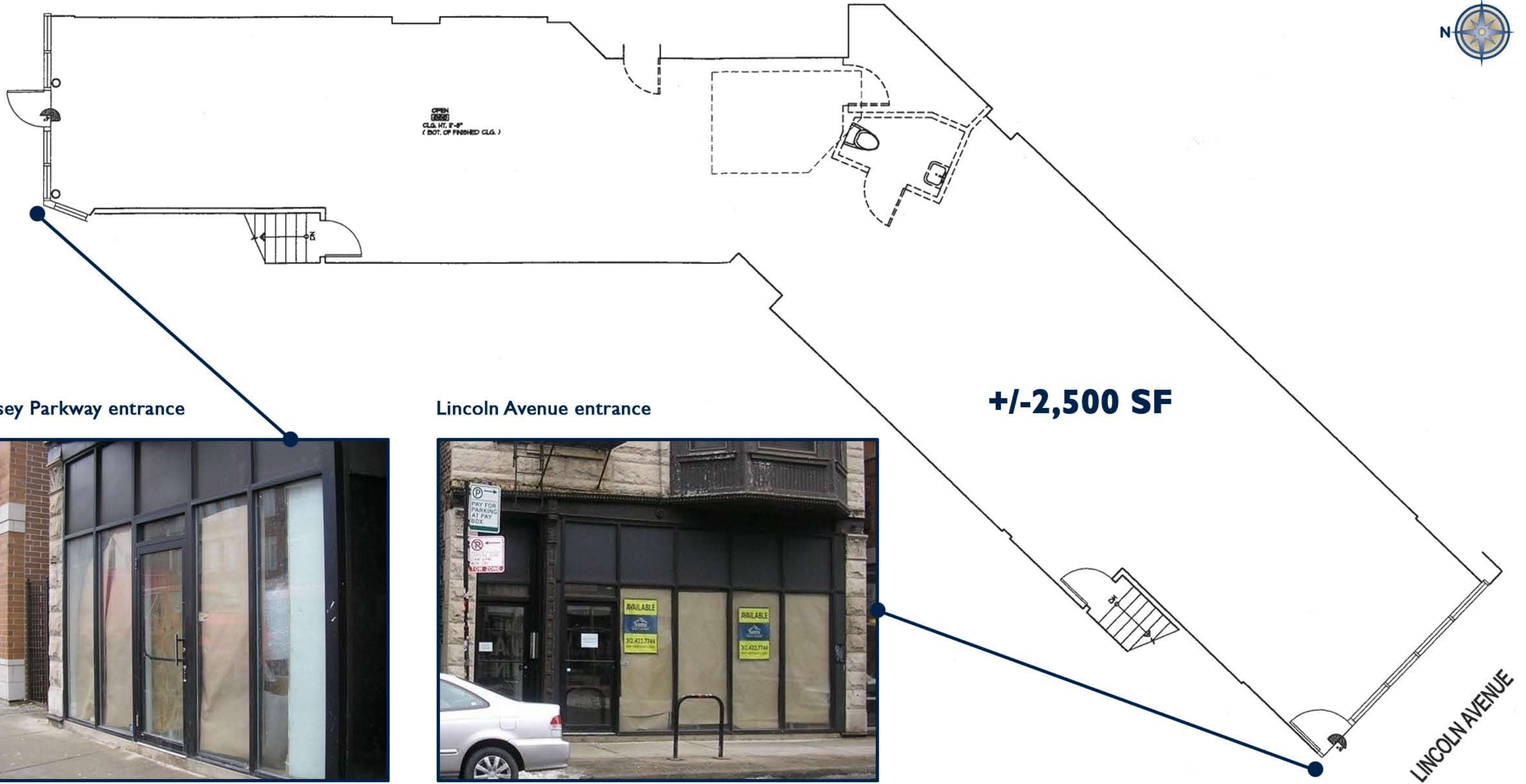
Diversey Parkway entrance