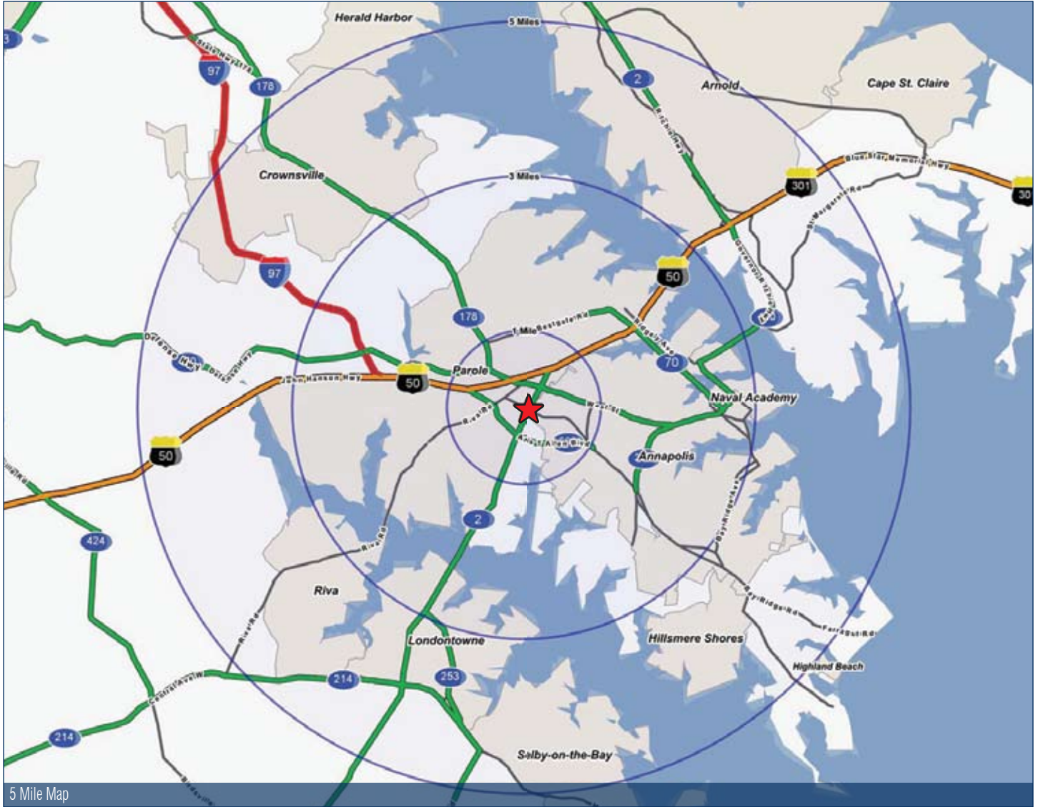
5 Mile Map