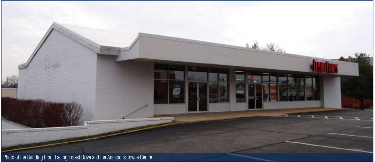
Photo of the Building Front Facing Forest Drive and the Annapolis Towne Centre