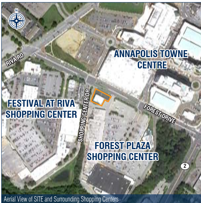
Aerial View of SITE and Surrounding Shopping Centers