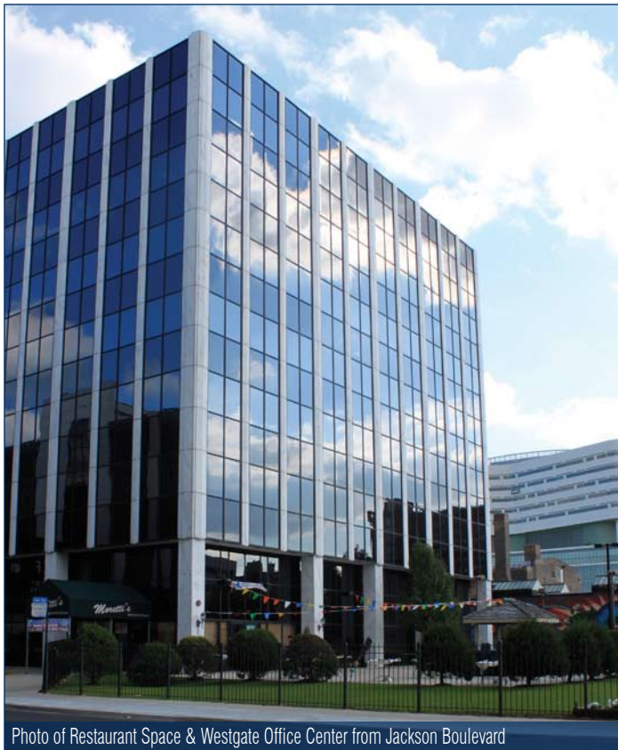
Photo of Restaurant Space & Westgate Office Center from Jackson Boulevard