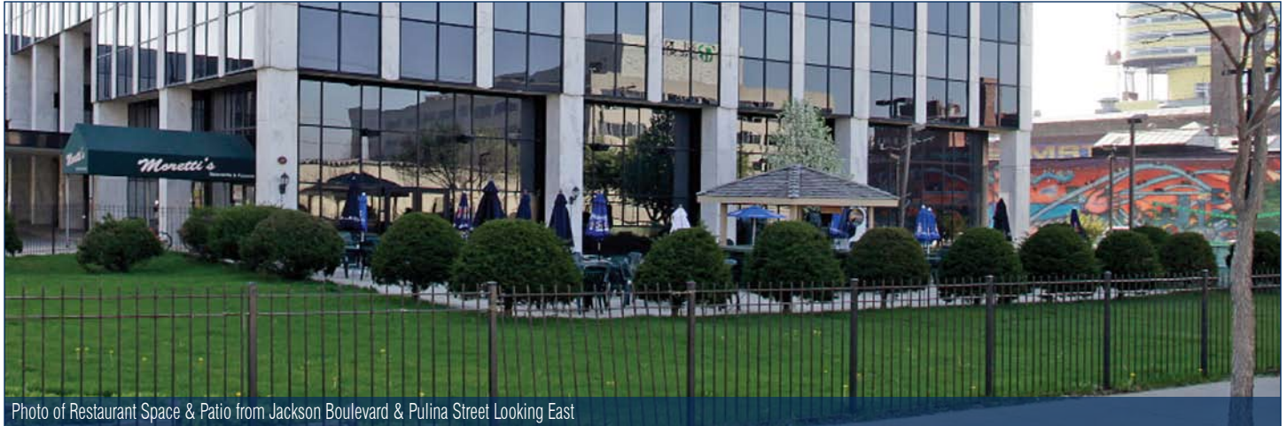
Photo of Restaurant Space & Patio from Jackson Boulevard & Pulina Street Looking East