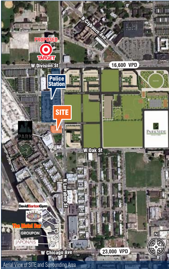
Aerial View of SITE and Surrounding Area