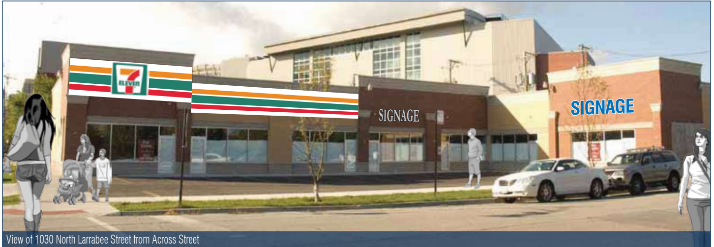
View of 1030 North Larrabee Street from Across Street